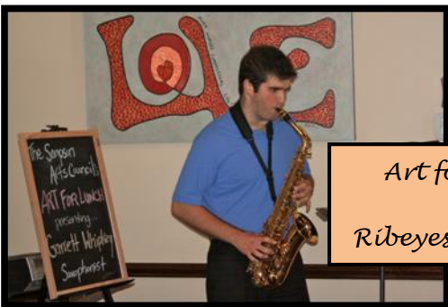
Art for Lunch at Ribeyes of Clinton