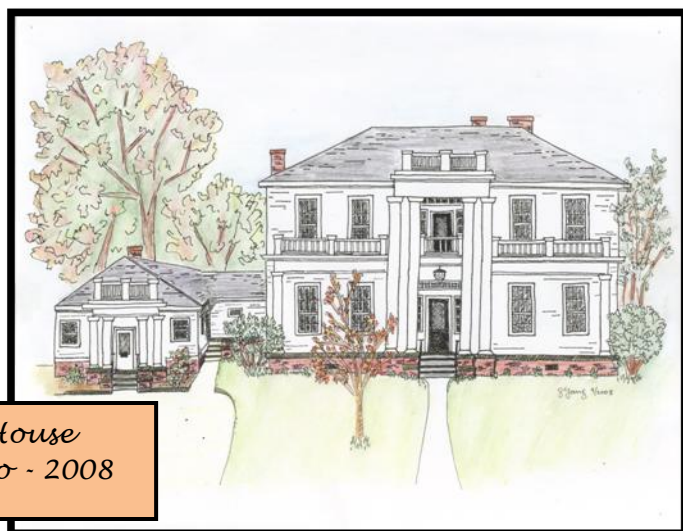
The Victor R. Small House drawing by Grace W. Ho - 2008